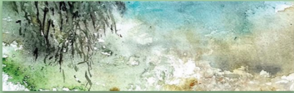
Jon Seals, Footnotes at Brooker Creek, 2024 Brooker Creek water, watercolor on Arches paper 3.5 x 11 inches

the Auditorium Gallery at Brooker Creek Preserve Environmental Education Center