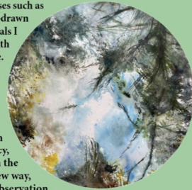
Jon Seals, Notes on Brooker Creek II, 2024 Brooker Creek water, watercolor on Arches paper 20 inch circle

In the summer of 2023, I began integrating traditional watercolor paints with water collected from the Gulf of Mexico, Tampa Bay, and regional freshwater lakes and streams. Painting en plein air has brought forth a heightened sense of intimacy, allowing me to engage with the environment in a new way, from direct observation.